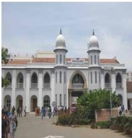
PSG College of Technology, Coimbatore: TN #1